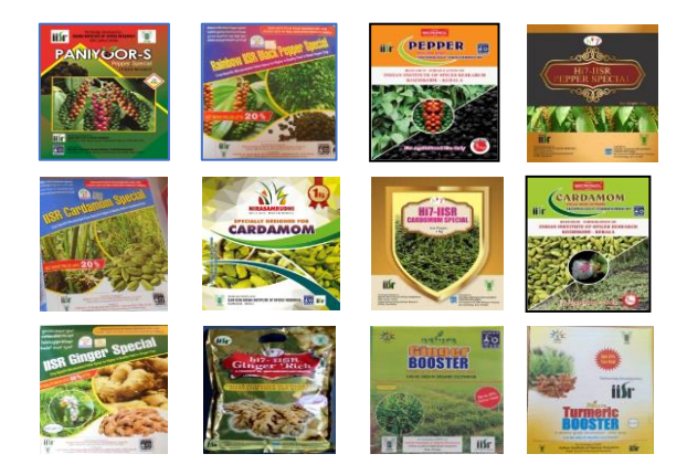
Micronutrient formulations of licensees

Crop specific micronutrient mixtures for black pepper, cardamom, ginger & turmeric. Four patents were awarded and 30 non-exclusive licenses (for Rs. 57 Lakhs) issued. Spread of the technology is in 8-10% of spice grown areas. Estimated Net value of Incremental production for two crop seasons ending 2020-21: Rs. 433 crores.