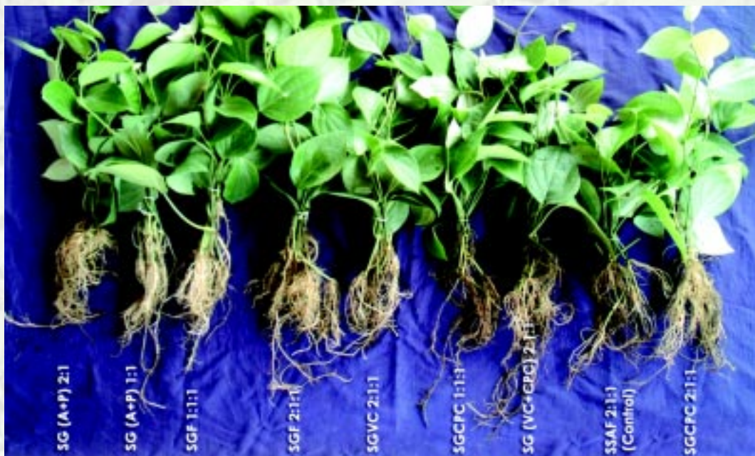
Granite powder- a substitute for sand in black pepper nursery mixture

The berries belonging to five varieties of black pepper were graded to 4 sizes i.e. <3.5mm, 3.5 to 3.8mm, 3.8 to 4.8mm and