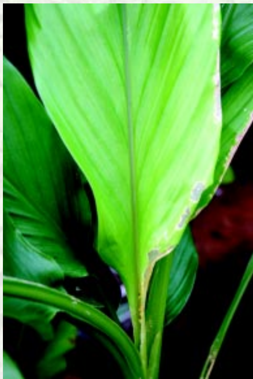
Early symptom of shoot borer larvae infestation on tender leaf of turmeric