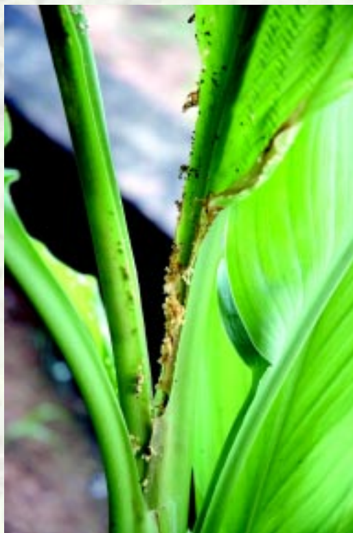
Symptom of entry of shoot borer larvae into central shoot of turmeric through leaf petiole

todes were observed throughout the crop season and the percentage of population of larvae parasitised by the nematode was higher during August and September.