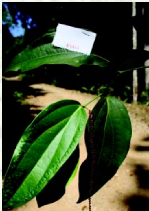
P. sugandhi a close relative of P. nigrum

subgroup in the phylogenetic classification. Variation in the inter-microsatellite regions among cultivars was found to be low.