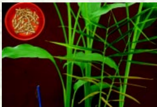
Curcuma amada - A bacterial wilt evading species in Zingiberaceae

Inset: Rhizomes of C. amada , Foreground: Wilting of Z. officinale , Background: Surviving C. amada