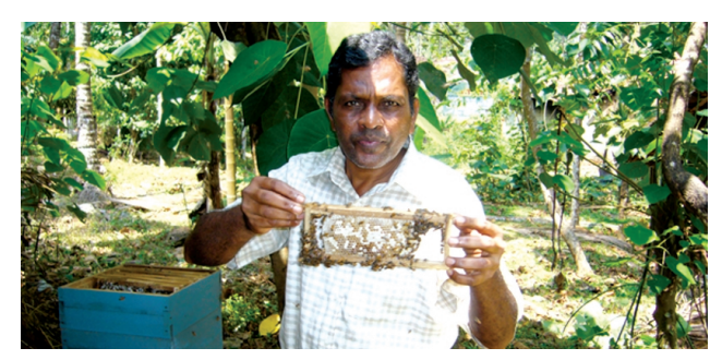
Apiculture- a risk free enterprise promoted by our KVK